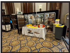
Big C booth at Home & Lifestyle EXPO

Our Three Oaks and Laporte locations held a booth at the Home & Lifestyle Expo on March 7th.