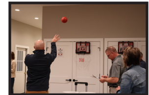
A basketball game set up for attendees