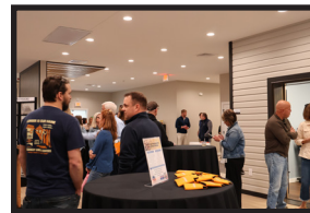
Attendees enjoying the new showroom