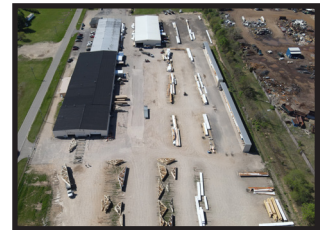
Aerial of Dowagiac location

Roger's statement was certainly accurate, SBC has become a critical component of Big C Lumber's success over the past 20 years and will for many years to come.