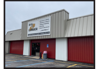
Exterior of Coloma location