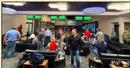
Employees bowling at outside sales meeting in Kalamazoo