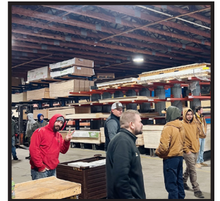
Group touring the Granger yard

We wish for all the current members to have a wonderful experience in the 2026 Career Development program!