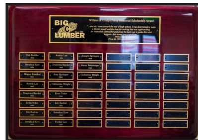
Plaque of previous scholarship recipients

Each year, we provide college scholarships to the children of Big C employees to help fund their learning and set them up for success in their careers. The scholarship awards up to $6,000 per year for students pursuing a four year degree, or up to $3,000 per year for students pursuing a two year degree through a community college or technical school. To submit an application, go to www.cfsjc.org/scholarshipapp to create an account and navigate to the apply page. The deadline to apply is February 15th. Similar to last year, we expect to award up to eight scholarships in 2026.