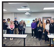
Van Buren Tech class